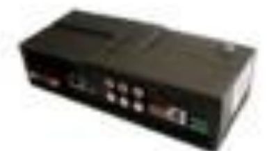
Z - Audio